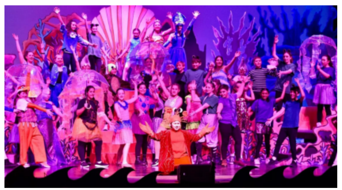
A cast of 51 LMS students performed the play adaptation of the Disney classic for the Littleton community on Jan. 19-21. Pictured above, the cast performs "Under the Sea."